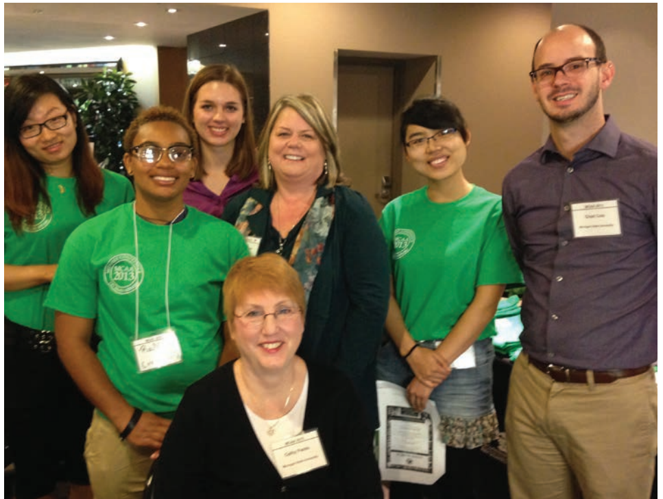
Asian Studies Center staff and conference volunteers.

Based on the extensive feedback provided by those who attended, the conference was a tremendous success. Conferees commented positively on everything from the professionalism of conference staff to the innovative panels. We would like to thank our sponsors, the program committee, the conference staff, and our volunteers for making this MCAA a wonderful opportunity to “show off” the strength of Asian Studies at Michigan State University.