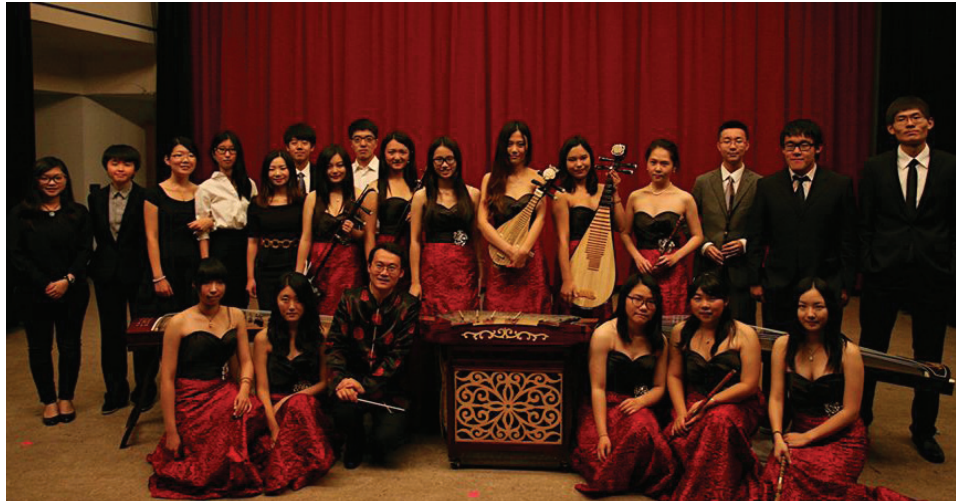
The Silk Road Chinese Orchestra.

The orchestra plays not only traditional Chinese music, but also combines traditional Chinese music with Western popular music. The orchestra has a composer from China who translates songs like the Beatles' "Hey Jude." Shujing herself can also play songs like "Over the Rainbow," from the film The Wizard of Oz , and