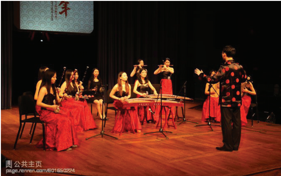
The Silk Road Chinese Orchestra at a performance.

"Memory," a song from the musical Cats . "I played 'Memory' last year at the concert at Marshall Music Company in Lansing, and people seemed to be touched by that piece. They seemed to really respond to that music," she says.