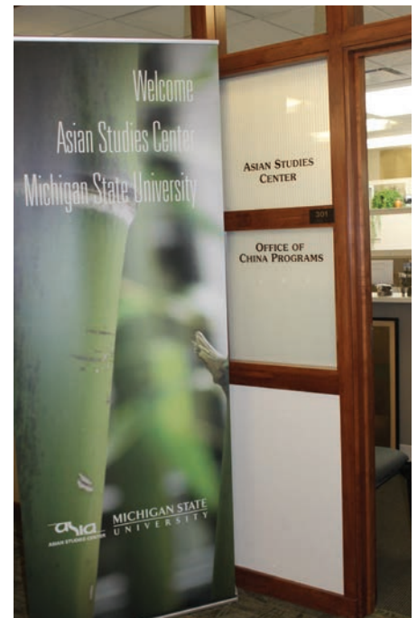
The MSU Asian Studies Center on the third floor of the International Center.