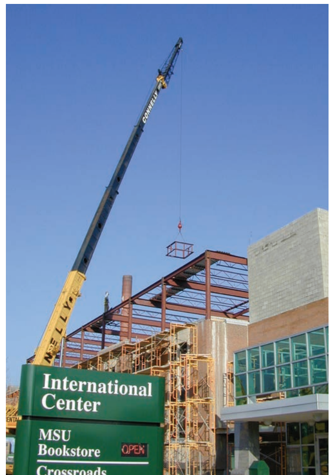
Construction of the third floor of the International Center, which opened in 2000.