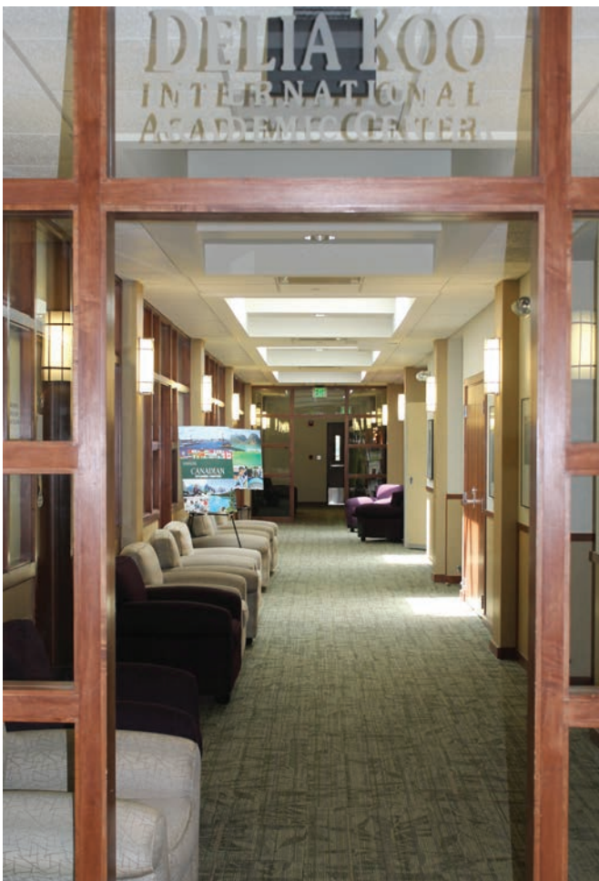
Delia Koo International Academic Center.