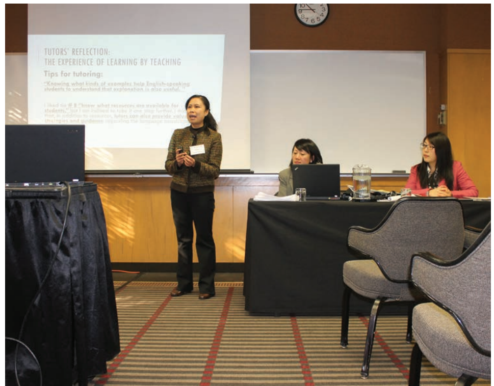
A panel at MCAA 2013.