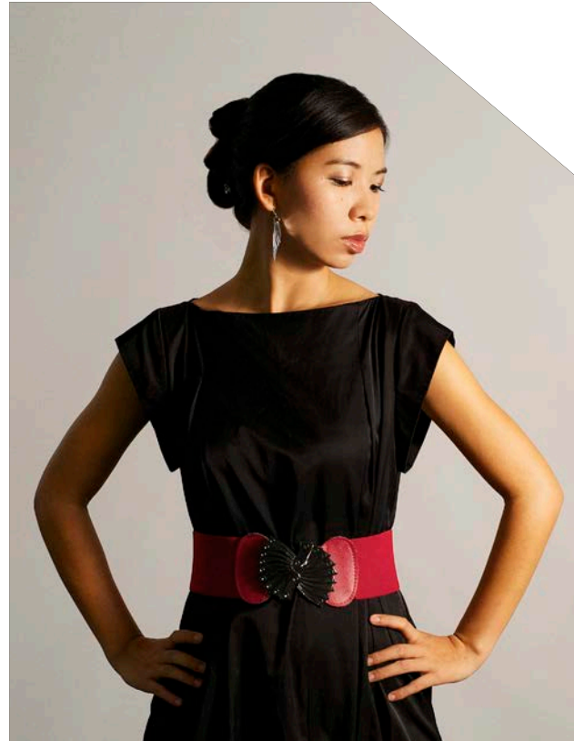
A model shows off the work of Thai Song (earrings)

To learn more about how you can support the Less Commonly Taught Languages program at MSU please visit: http://asia.isp.edu/supportus