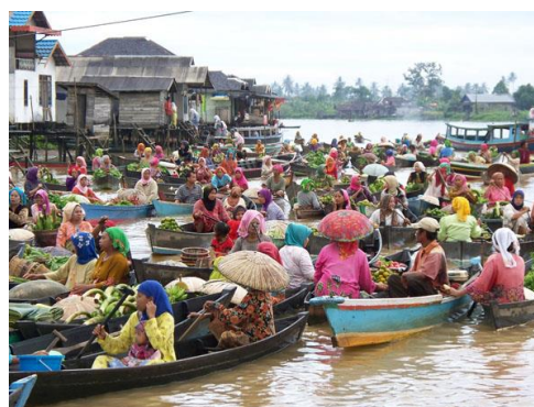
Grocery Shopping in Indonesia

MSU's first Chinese orchestra, this student ensemble will perform Chinese and American music.