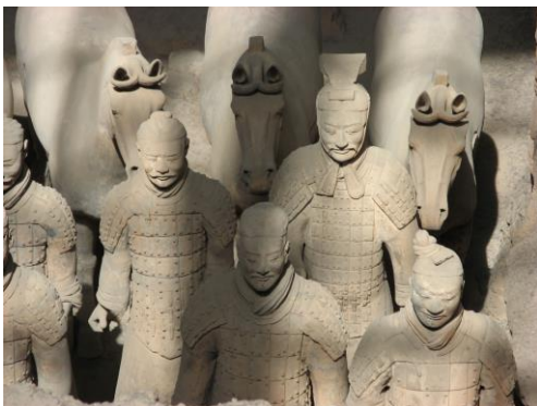
Terracotta Warriors in Xi’an, China