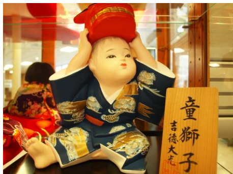
Hand-crafted Japanese Doll