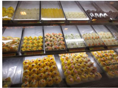
Shop of Indian Sweets

Lihong Yang, "Construct Validity and Measurement Invariance of a Discourse Completion Test"