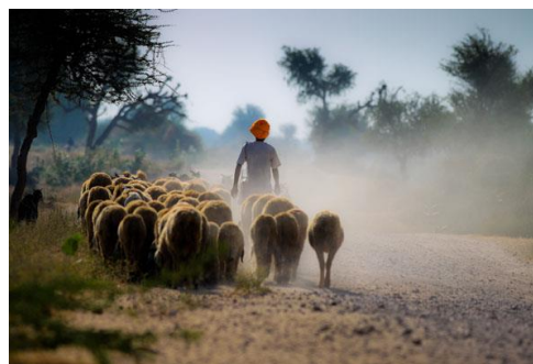
Rajasthani Goatherd in India