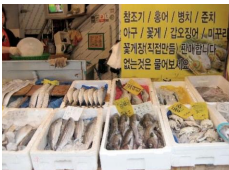
Fish and Seafood Market in Cheonju, South Korea