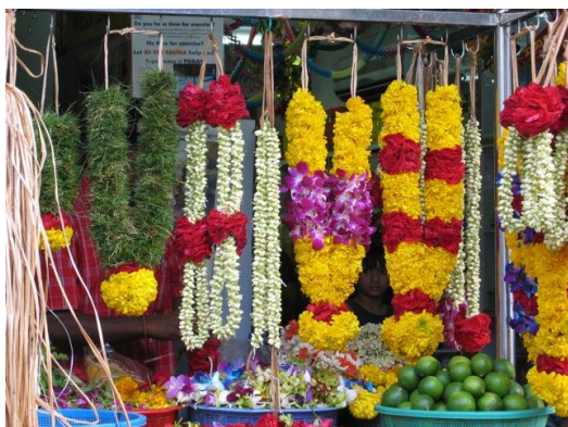
Market in Singapore