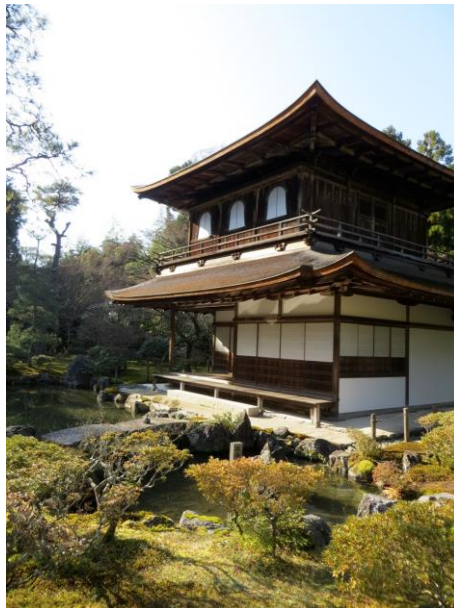
Silver Pavilion in Kyoto, Japan

Percy Buchanan Prize for Japan & Korea [No prize awarded]