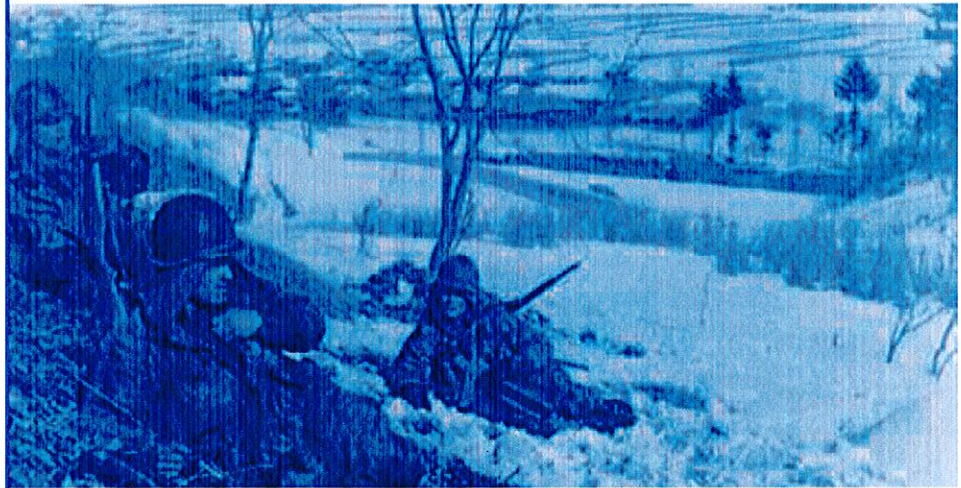
Winter Battle Scene in Korea

As students work on their paragraphs, circulate to ensure they understand the differences between a market economy and a command economy.