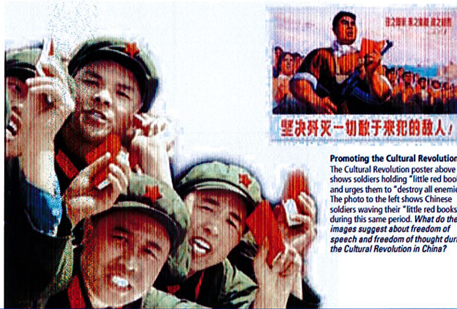
Promoting the Cultural Revolution The Cultural Revolution poster above shows soldiers holding "little red books" and urges them to "destroy all enemies." The photo to the left shows Chinese soldiers waving their "little red books" during this same period. What do these images suggest about freedom of speech and freedom of thought during the Cultural Revolution in China?

Split With the Soviet Union The People's Republic of China and the Soviet Union were uneasy allies in the 1950s. Stalin sent economic aid and technical experts to help China modernize, but distrust between the two countries created tensions. Some of these tensions dated back to territorial disputes between tsarist Russia and dynastic China. By 1960, border clashes and disputes over ideology led the Soviets to withdraw all aid and advisors from China. Western fears of a strong alliance between the Soviet Union and China had proved unfounded.