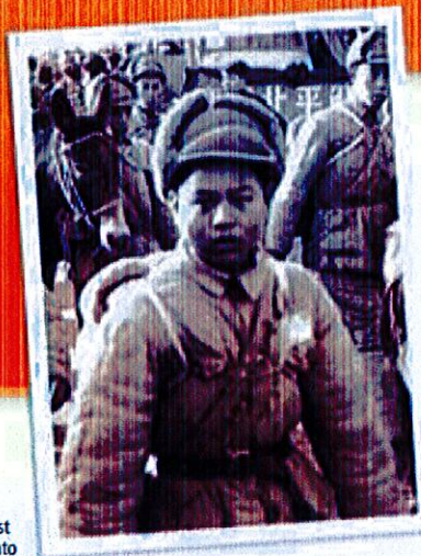
Chinese Communist soldier marching into Beijing, 1949

The "little red book" of quotations from Mao Zedong