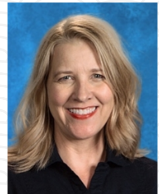
Fifth Grade Teacher, Winchester Thurston School

This workshop will focus on three children's literature books, each providing insight into childhood in a different Asian country. Participants will explore the system of cultural beliefs and values revealed through the characters' thoughts, words, and actions in each of the titles along with ways each book might be used to support cultural connections in the classroom.